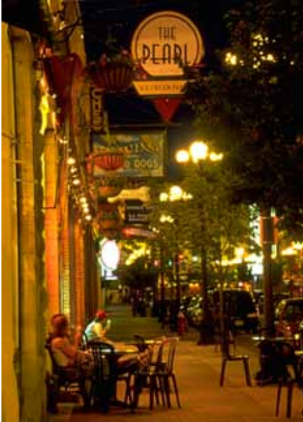
La Crosse serves as an example of a high-density downtown with pedestrian-friendly features.

The public finance system was also perceived to hinder sustainable urban form and land use patterns. The reliance on local property taxes and tax incremental financing (TIF), for example, often encourage community expansion and competition between communities. As typically practiced, many of these policies do not adequately encourage rehabilitation, redevelopment and reinvestment within the urban core and existing walkable neighborhoods. Rather, public finance tools, including TIF, are often being used to support car-dependent peripheral development.