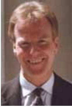
Peter Senge, founding chair of the Society for Organizational Learning and author of "The Necessary Revolution: How Individuals and Organizations Are Working Together to Create a Sustainable World."

able development or they do not know how to implement them through effective visions, strategies and concrete actions.